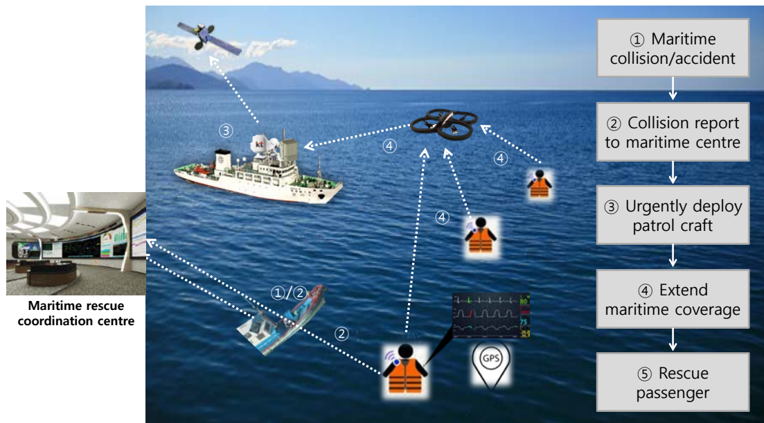
Fig. 6.1.3-1 LTE maritime Service Scenario

5. A rescue request is repeatedly transmitted from an air jacket of a user who is adrift once a user pressed the button and moving UE receives his/her rescue request so his/her location is identified.