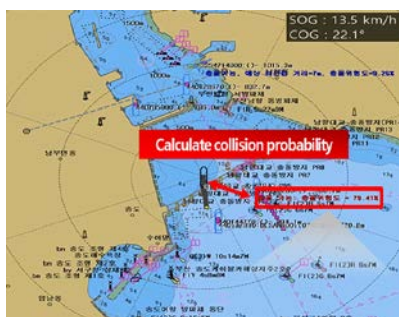
Figure 7.7.3-1 Example of maritime platform

1. Maritime platform (Figure 7.7.3-1) calculates collision probability based on speed on ground (SOG) and course on ground (COG).