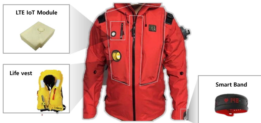
Figure 6.1.1-1: Wearable IoT device